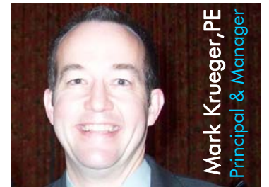
Wiss, Janney, Elstner Associates

LOCATION: Pi π — 28847 Franklin Road, Southfield