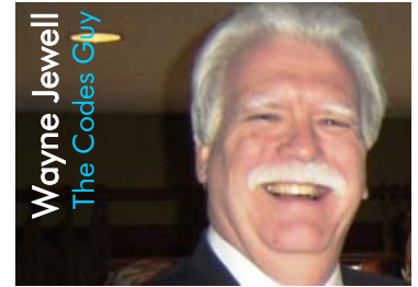
The City of Southfield