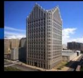
One Detroit Center