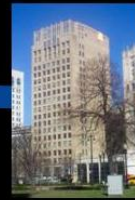
Grand Park Centre