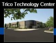
Trico Technology Center

AWARD WINNERS The Office Building of the Year